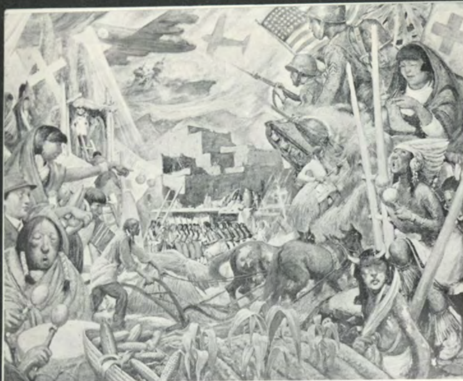
THE PUEBLOS PARTICIPATE IN WAR—Oscar E. Berninghaus