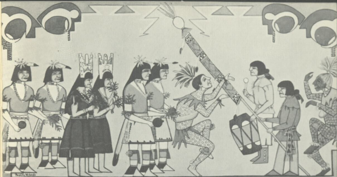
PABLITA VELARDE "Corn Dance" Juror