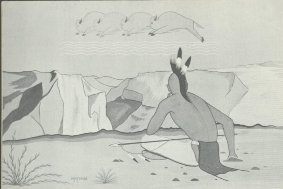
SOLOMON McCOMBS "Mirage" Honorable Mention