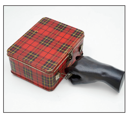
Mildred Howard , Square Meal , 2021, cast bronze and found object.